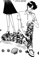
RYUUCHI THE FIRST GUY SHINJU MET